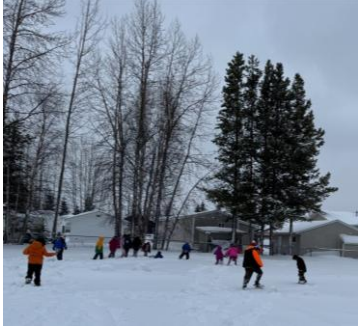
Snowshoeing Glenview Elementary students in December!